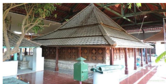
Figure 2. Tomb Shape

This refers to the position of Wali as an insan kamil (perfect human) as the embodiment of God. Judging from the shape of the building, Sunan Giri's tomb is like a temple consisting of the bottom, body, and roof. The roof is in the form of an overlapping roof. The terrace roof is a Hindu building art tradition that is known before Islam. The tomb building with a cupola and an overlapping roof that is similar to the Hindu-Islamic tradition can be understood as a form of a cultural shock to attract the sympathy of people who have not believed in Islam. On the one hand, the shape of the building does not conflict with Islamic values [7].