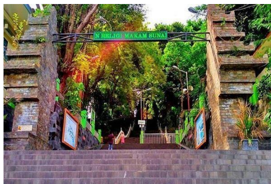
Figure 1. Stairs to the tomb

The second yard is north of the first one. Characterized by a gate made of red brick, in this courtyard, there are two terraces with different heights. Each is marked with an ancient tomb. The third yard is the most important part. In this yard, there is the tomb of Sunan Giri [6]. The tomb, a cupola with three roofs was built. The overlapping roof is a symbol of God's power and greatness.