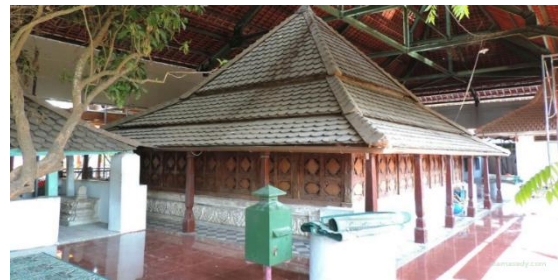
Figure 2. Tomb Shape

This refers to the position of Wali as an insan kamil (perfect human) as the embodiment of God. Judging from the shape of the building, Sunan Giri's tomb is like a temple consisting of the bottom, body, and roof. The roof is in the form of an overlapping roof. The terrace roof is a Hindu building art tradition that is known before Islam. The tomb building with a cupola and an overlapping roof that is similar to the Hindu-Islamic tradition can be understood as a form of a cultural shock to attract the sympathy of people who have not believed in Islam. On the one hand, the shape of the building does not conflict with Islamic values [7].