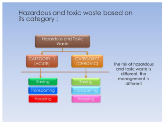
Figure 3. Risk-based of processing management hazardous and toxic waste