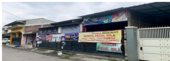
Figure 1. Resident SMEs in the Culinary field

350 individuals, or almost 68 percent, of the total 512 persons of productive age work, in both commercial and government sectors. In different types of business, 86 persons, or 17 percent, become business actors. According to a survey, the types of SMEs that emerge in Kampung Mina Mangrove include culinary, fish and other marine product dealers, flower pot vendors, mangrove processing firms, and decorative plants. Documentation of community SME activities is provided below, including: