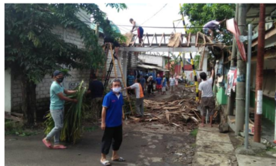
Figure 3. Gotong Royong to Build a Gate

The potential of a group and the ties between people inside that group in which there exist social networks, values, norms, and beliefs among group members are referred to as social capital. Community service, cleaning the village, maintaining village security, and participation in government initiatives are all examples of how social capital may be displayed (Bebbington et al., 2006). The government can also employ neighbourhood and hamlet institutions to ensure the success of its plans, such as the building of Figure 3.