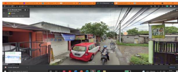
Figure 4. Main Street in Kampung Mina Mangrove, East Wonorejo

Physical capital is one of the most important assets of every SME. According to Green and Hainess, there are two major types of physical capital: buildings and infrastructure. According to data from researcher observations, the majority of people of Mina Mangrove community already own privately owned dwellings with permanent structures. However, there are individuals who do not have a well-maintained private residence. One of the facilities that continues to receive complaints is the main road in the Mina Mangrove settlement. This is the only way to get to a number of dwellings and mangrove tourist locations.