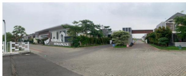
Figure 5. Housing in East Wonorejo's Kampung Mina Mangrove