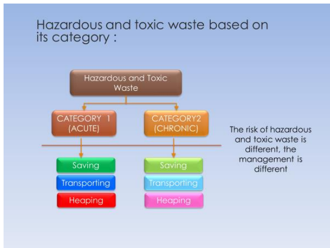
Figure 3. Risk-based of processing management hazardous and toxic waste