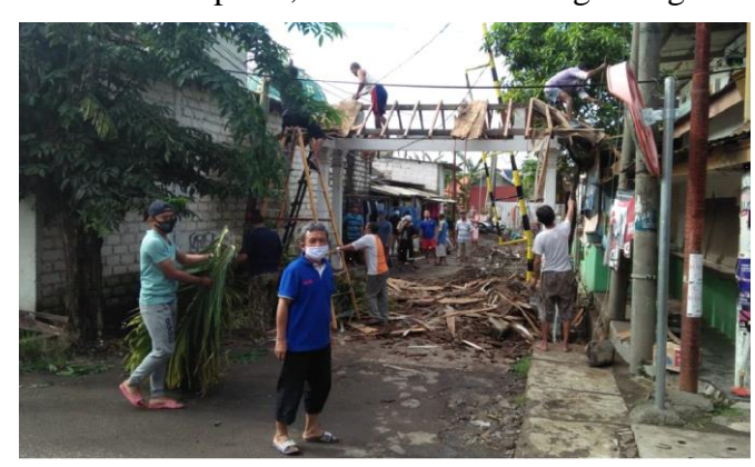
Figure 3. Gotong Royong to Build a Gate

The potential of a group and the ties between people inside that group in which there exist social networks, values, norms, and beliefs among group members are referred to as social capital. Community service, cleaning the village, maintaining village security, and participation in government initiatives are all examples of how social capital may be displayed (Bebbington et al., 2006). The government can also employ neighbourhood and hamlet institutions to ensure the success of its plans, such as the building of Figure 3.