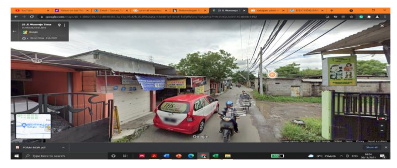
Figure 4. Main Street in Kampung Mina Mangrove, East Wonorejo

Physical capital is one of the most important assets of every SME. According to Green and Hainess, there are two major types of physical capital: buildings and infrastructure. According to data from researcher observations, the majority of people of Mina Mangrove community already own privately owned dwellings with permanent structures. However, there are individuals who do not have a well-maintained private residence. One of the facilities that continues to receive complaints is the main road in the Mina Mangrove settlement. This is the only way to get to a number of dwellings and mangrove tourist locations.