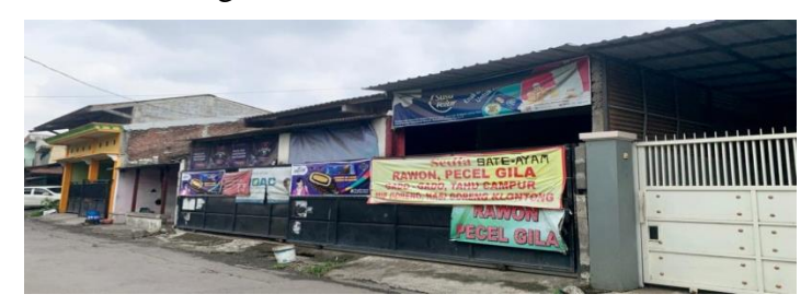
Figure 1. Resident SMEs in the Culinary field

350 individuals, or almost 68 percent, of the total 512 persons of productive age work, in both commercial and government sectors. In different types of business, 86 persons, or 17 percent, become business actors. According to a survey, the types of SMEs that emerge in Kampung Mina Mangrove include culinary, fish and other marine product dealers, flower pot vendors, mangrove processing firms, and decorative plants. Documentation of community SME activities is provided below, including: