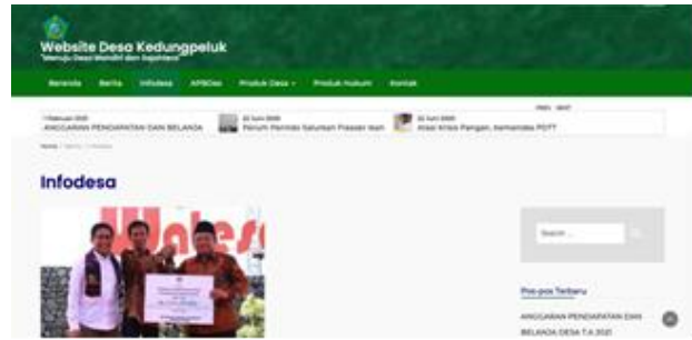
Figure 1. Menu/features on the village information system

The data on the number of villages in Sidoarjo Regency show that there is a huge possibility to create e-government within the scope of village government. The government of Sidoarjo Regency, through the Office of Communication and Information, has undertaken attempts to establish a village information system in conjunction with other authorities. However, it appears that the village information system is merely informational, and so it is unable to meet the demands of the village administration in processing village data. This is evident in the menu/features of the village information system that has been built, as seen in the figure below.