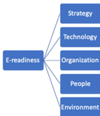
Figure. 2 Framework model stope

The Technology Acceptance Model is another method proposed by Davis (TAM) [7]. Furthermore, the Computer System Policy Project (CSPP) (in Yusif et al. 2017) defines e-readiness as follows: 1) infrastructure, 2) access, 3) application and service, 4) economics, and 5) enabler. Furthermore, Al-Oasimi (2008) created the STOPE framework for the future e-readiness assessment model, which stands for strategy, technology, organization, people, and environment [8]. The STOPE model framework is depicted in the diagram below.