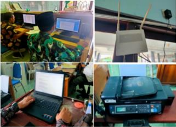
Figure 3. Availability of technology infrastructure in the village of kedungluk (Researcher Documentation)

According to the findings of the field data, the availability of technological infrastructure in Kedungluk Village is mostly not committed to the creation of village e-monographs. As a result, the quantity of technological infrastructure available is still relatively restricted. The following are the number and specifications of the technology infrastructure: