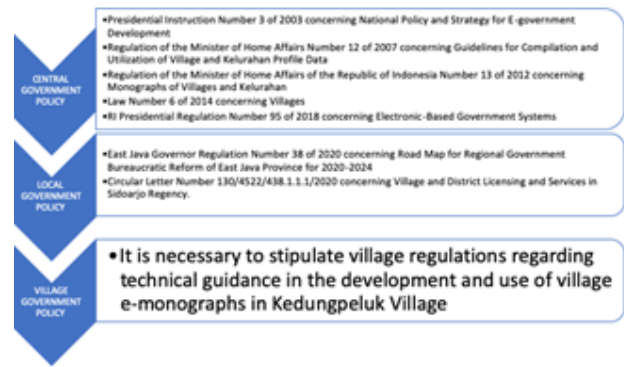
Figure. 6 policy guidelines in the development of village e-monographs in the village of Kedungluk

According to the above description, the readiness of policies in the development of village e-monographs in Kedungluk Village is quite ready, as evidenced by several policies set by the central government and regional governments (East Java Provincial Government and Sidoarjo Regency Government) related to e-commerce development. -information systems for the government and villages the graphic below depicts several regulations that serve as recommendations or the foundation for the creation of village e-monographs in Kedungluk Village.