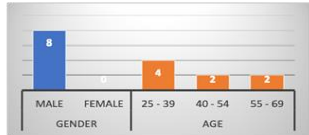
Figure 4. Number of village officials in Kedunglukan by gender and age

authorities are men. The availability of village equipment can be improved to aid in the creation of village e-monographs. The following figure depicts the preparedness of village authorities in Kedungluk Village depending on gender and age: