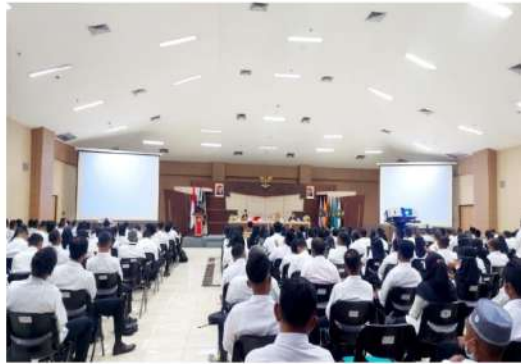
Figure 4: Briefing for Village Past Learning Recognition Students study program of Administration Science

"The opening ceremony was held at the two universities that held it, namely the first opening at Yogyakarta State University, which was also attended by the Ministry of Villages, represented by heads of agencies in the Ministry of Villages, Development of Disadvantaged Regions and Transmigration, Higher Education Organizers, Chancellor of the University, Deputy Chancellor, Head of Program Studies, and study program lecturers who directly go down to the field to teach students, along with scholarship funders".