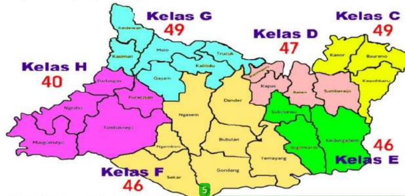
Figure 3: Map of class distribution of Recognition of Past Learning in the Village of Public Administration Science Study Program

students to work together and discuss the lectures. Figure 3 depicts the class distribution map for the Village Past Learning and Recognition Program, an undergraduate program in public administration.