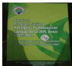
Figure 2: Guidebook for the Village Past Learning Recognition Undergraduate Program 2022-2024