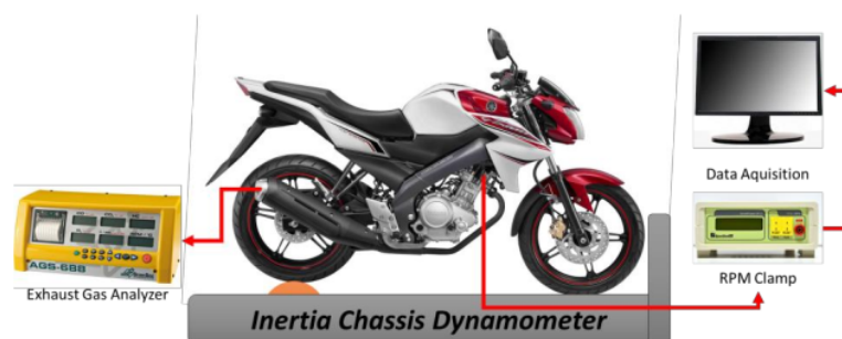
Figure 1. Objects and research instruments.

Yamaha New Vixion Lightning standard muffler with a catalytic converter. Experiments carried out starting from 1200 rpm idle rotation to 9000 rpm with a range per 500 rpm. Each research variation was tested three times, and then the test results were averaged. The schema of the research instrument can be seen in Figure 1.