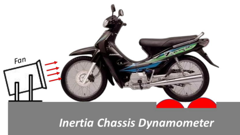
Figure 1. Research Instruments.

To obtain valid and accurate research data, the engine performance testing method is carried out based on the SAE J1349 standard, namely the Engine Power Test Code-Spark Ignition and Compression-Ignition-Net Power Rating [26]. Data analysis using descriptive method. Descriptive method is used to analyze data by describing the data that has been collected to analyze data by describing the collected data as it is and presented through tables and graphs [27].