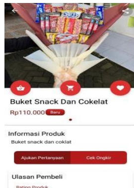
Figure 6. Product display