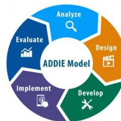
Figure 1. ADDIEStage

The ADDIE model is one of the instruction designs models that are often the basis for other instructional design models. In general, the ADDIE model (Rosset, 1987) consists of the Analysis, Design, Development, Implementation, and Evaluation phases [5]. The ADDIE stages are as follows.