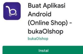
Figure 3. Applications Open Olshop