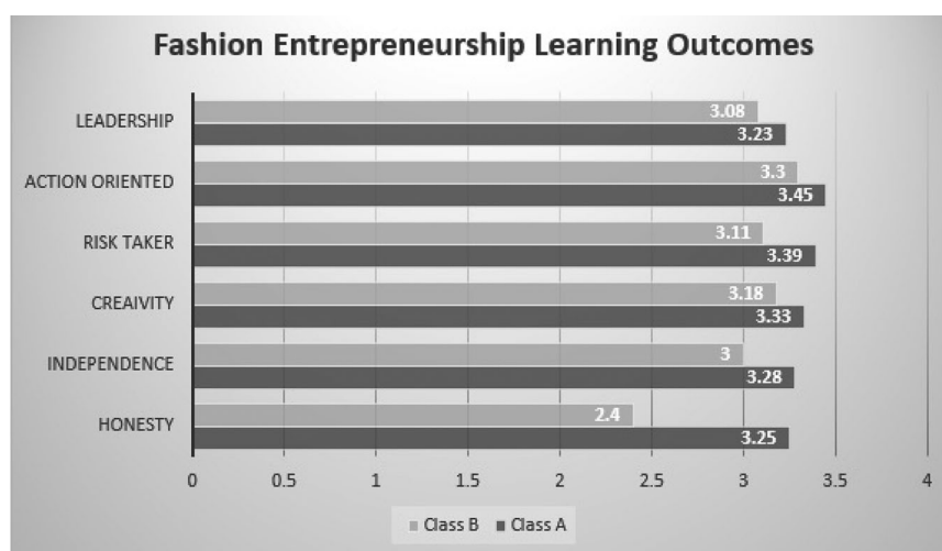
Figure 1. Histogram of fashion entrepreneurship lesson learning outcomes scores.

tendency that students have high levels of entrepreneurship motivation. According to Table 2, the work itself and responsibility provide a low level of motivation. Meanwhile, a high level of motivation lies in recognition, progress, and achievement. Data on entrepreneurship motivation values are shown in Figure 2.