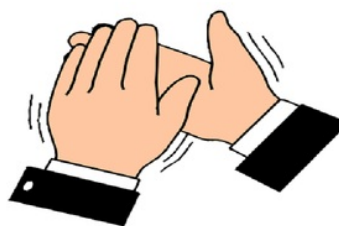
Figure 5. Clapping hands