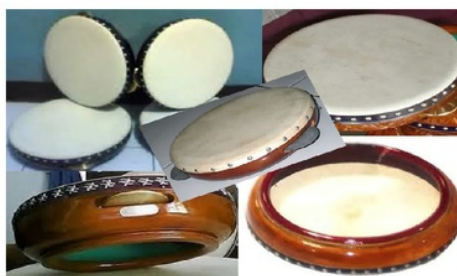
Figure 4. Picture of Tambourine