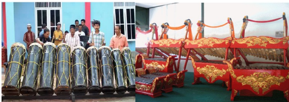
Figure 3. Picture of Kolintang and Gondang Sembilan

instrument up to Balinese traditional musical instrument, Javanese traditional musical instrument, angklung , tambourine, kolintang , and Gondang Sembilan .