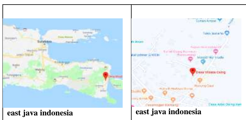
Figure 1: Map of the research area

In Kemiren Village, Banyuwangi Regency, there is a studio that provides learning facilities for communities of productive age, i.e between 15-25 years, by giving cultural training and education based on Osing cultures to this group of young people. Kemiren Village is located not far from the city center of Banyuwangi. The winding and hilly access to this village turns out to be the one of factors that makes the Kemiren traditional village becomes one of the villages with a well-preserved cultural customs. Kemiren Village with all its uniqueness has become a cultural tourism village for a long time, so that the Banyuwangi Regional Government established Osing Village that located inside the Kemiren Village, Glagah District, Banyuwangi Regency as a cultural conservation site. The name of the Osing village originated from the habit of Osing people who still maintain the local traditions. The word "Osing" in the Osing language itself can be interpreted as "no". There is an anecdote that tells about the existence of the Osing people, when foreigners ask Banyuwangi people, are you Balinese or Javanese? They answered with the word "Osing" which means not both of them.